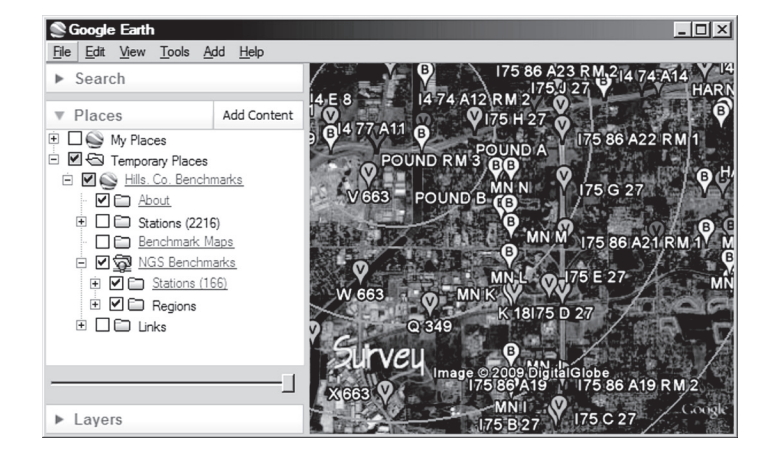
Figure 3. NGS Benchmarks

Range rings are drawn at one-mile increments from the POI and collected in the Regions folder.